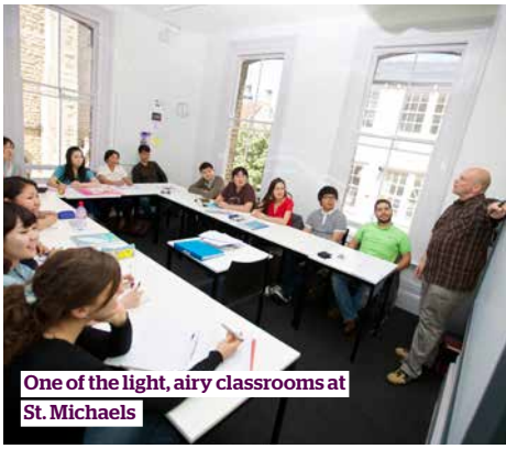
One of the light, airy classrooms at St. Michaels