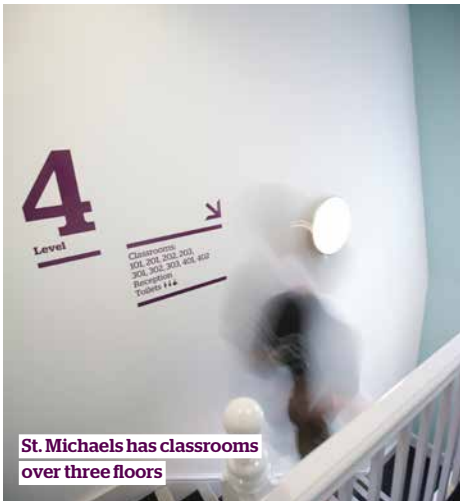
St. Michaels has classrooms over three floors