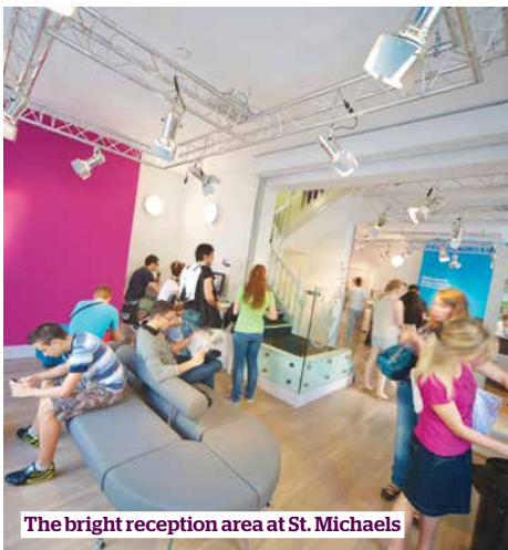
The bright reception area at St. Michaels