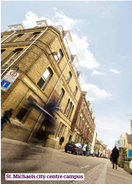
St. Michaels city centre campus