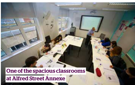
One of the spacious classrooms at Alfred Street Annexe

Kings Oxford consists of two fantastic campuses – St. Josephs in the popular area of Cowley and St. Michaels in the city centre. Offering a bright, compact, and modern space, St. Michaels is surrounded by shops, restaurants, and some of Oxford's foremost tourist attractions. Just a 5 minute walk away is the Alfred Street annexe, a further College building containing extra classrooms. St. Michaels campus is where the majority of English programmes take place.