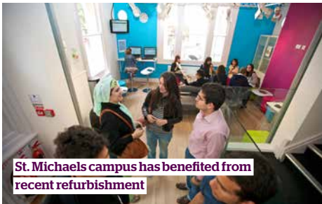
St. Michaels campus has benefited from recent refurbishment