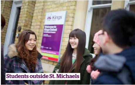
Students outside St. Michaels