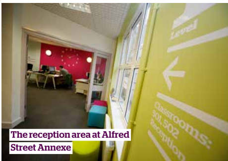
The reception area at Alfred Street Annexe