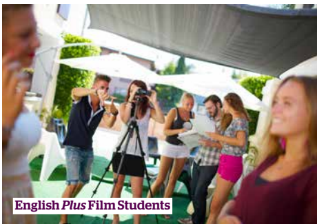
English Plus Film Students