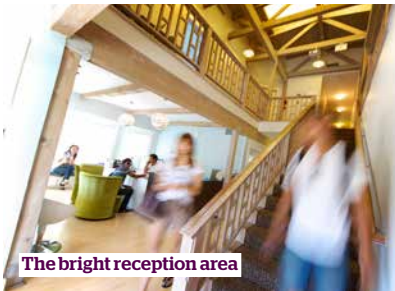
The bright reception area

Kings Los Angeles is located in the heart of Hollywood, occupying two buildings within a 3 minute walk. The main teaching center sits between Hollywood and Sunset boulevards, and enjoys bright, spacious classrooms and an Apple Mac computer suite. It also benefits from great outdoor space for socialising and eating. The stylish annex building is situated on Sunset Boulevard and offers a modern learning environment with classrooms, student lounge and guided study area.