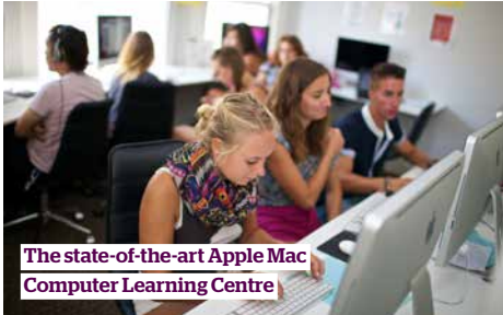
The state-of-the-art Apple Mac Computer Learning Centre