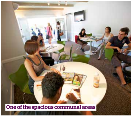
One of the spacious communal areas