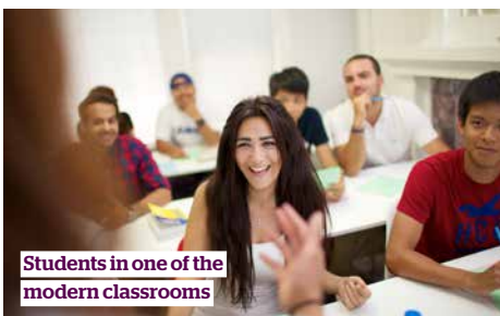
Students in one of the modern classrooms