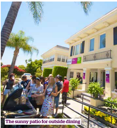
The sunny patio for outside dining

Kings Los Angeles is located in the heart of Hollywood, occupying two buildings within a 3 minute walk. The main teaching center sits between Hollywood and Sunset boulevards, and enjoys bright, spacious classrooms and an Apple Mac computer suite. It also benefits from great outdoor space for socialising and eating. The stylish annex building is situated on Sunset Boulevard and offers a modern learning environment with classrooms, student lounge and guided study area.