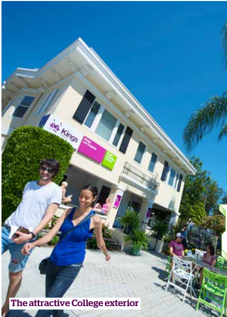
The attractive College exterior