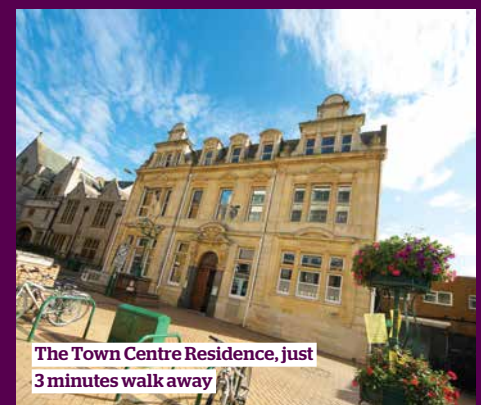
The Town Centre Residence, just 3 minutes walk away

Homestays are located within 30 minutes of the College by bus, and are carefully selected and inspected by our Accommodation Officers. Single rooms are available year round, and twin rooms available during the summer only. Homestay Extra is also available for those who want the use of a private bathroom, a double bed and a television in the room.