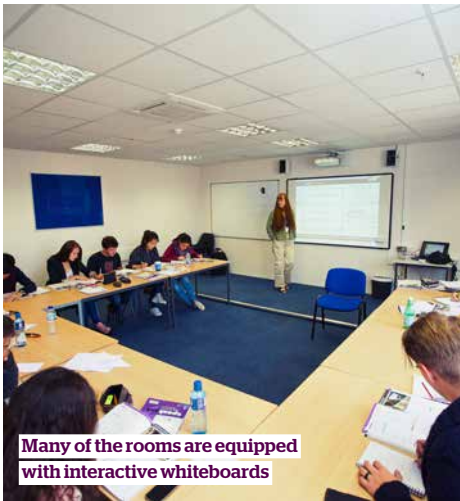
Many of the rooms are equipped with interactive whiteboards