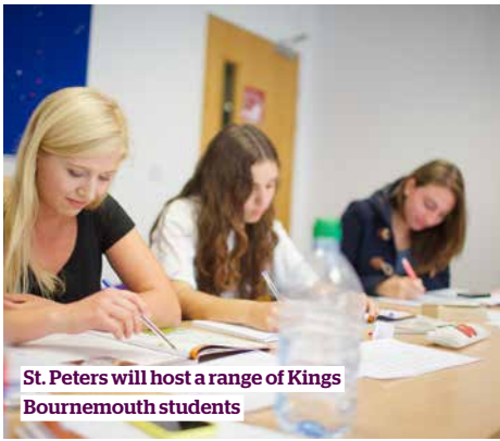
St. Peters will host a range of Kings Bournemouth students