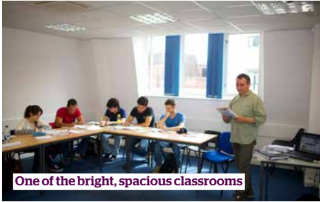
One of the bright, spacious classrooms