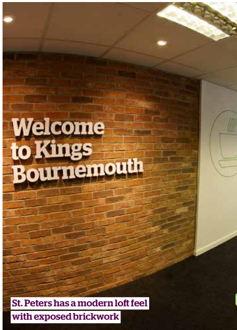
St. Peters has a modern loft feel with exposed brickwork