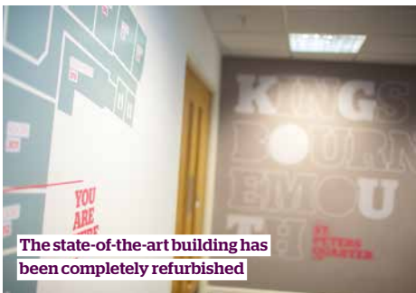
The state-of-the-art building has been completely refurbished