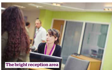
The bright reception area

Our brand new building at St Peters Quarter is located in the heart of Bournemouth city centre. Occupying the entire top floor of a centrally located building, it boasts bright, spacious classrooms with interactive whiteboards, a computer learning centre and a large social area. The building has been entirely refurbished to provide an ultra-contemporary loft feel, complete with exposed brickwork, steel columns and ceiling.