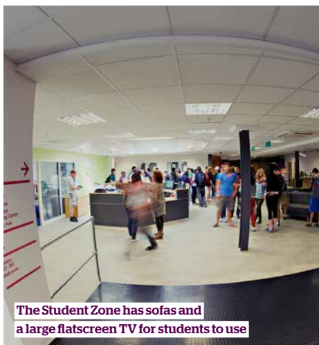
The Student Zone has sofas and a large flatscreen TV for students to use