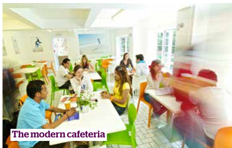
The modern cafeteria