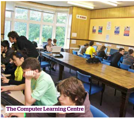
The Computer Learning Centre