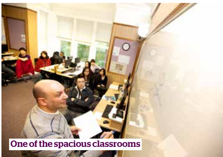
One of the spacious classrooms