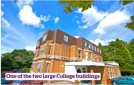
One of the two large College buildings