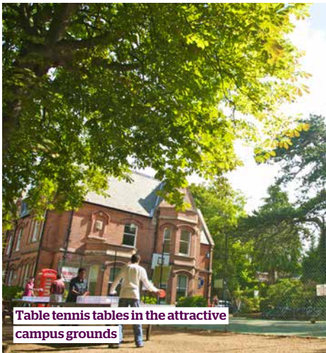
Table tennis tables in the attractive campus grounds