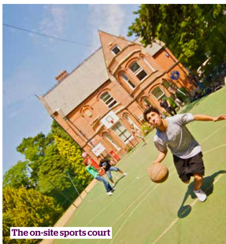
The on-site sports court