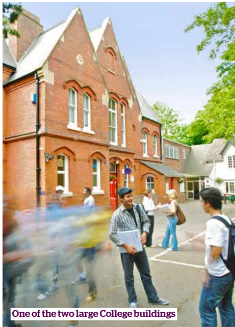
One of the two large College buildings