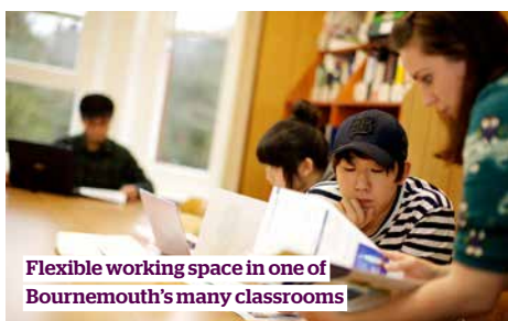
Flexible working space in one of Bournemouth's many classrooms

Kings Bournemouth's Braidley Road campus is located in an attractive residential area, close to the city centre. Consisting of two large buildings, it is the main teaching and administration centre, and is surrounded by gardens with lawns and patios. Facilities at the campus are fantastic, with spacious, well-equipped classrooms, two computer learning centres, a leisure/activity hall and a cafeteria and restaurant. Outside, there is a dedicated on-site sports court.