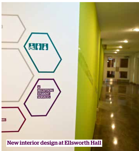
New interior design at Ellsworth Hall