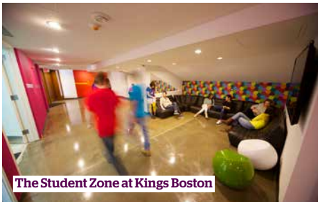
The Student Zone at Kings Boston