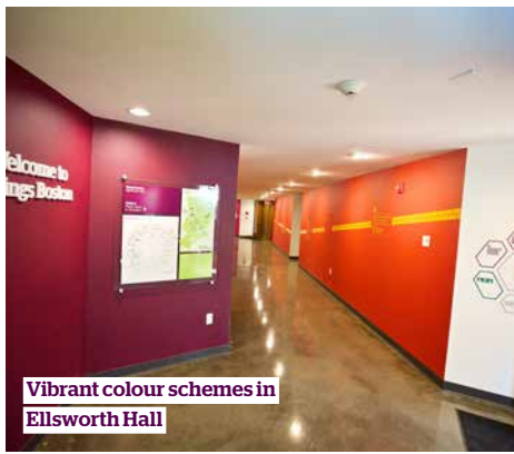
Vibrant colour schemes in Ellsworth Hall