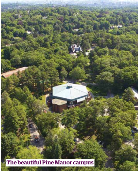
The beautiful Pine Manor campus