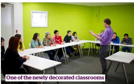
One of the newly decorated classrooms

Kings Boston is located on the campus of Pine Manor College, one of the most attractive colleges in the whole of New England. This beautiful 60-acre site is located in the exclusive suburb of Chestnut Hill, only 20 minutes from downtown Boston. On campus, students benefit from beautiful woodland surroundings, and newly refurbished teaching and accommodation blocks with a bright, modern feel.