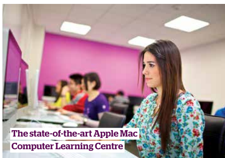
The state-of-the-art Apple Mac Computer Learning Centre