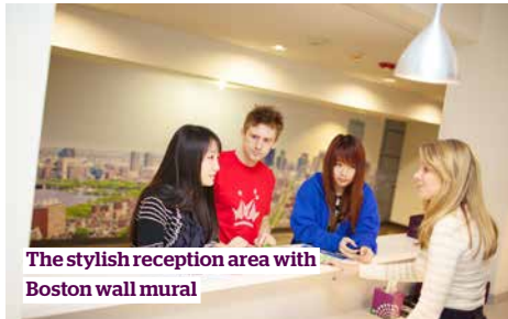
The stylish reception area with Boston wall mural