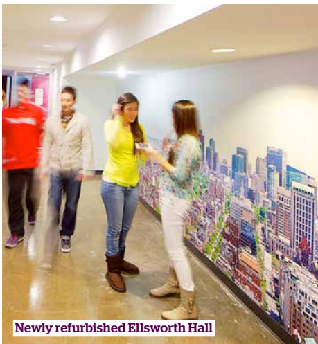
Newly refurbished Ellsworth Hall