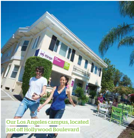
Our Los Angeles campus, located just off Hollywood Boulevard