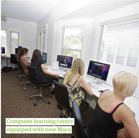
Computer learning centre equipped with new Macs